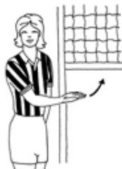
Crossing Center Line