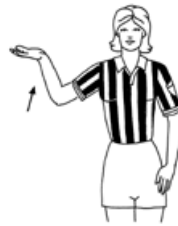
Held or Carried Ball