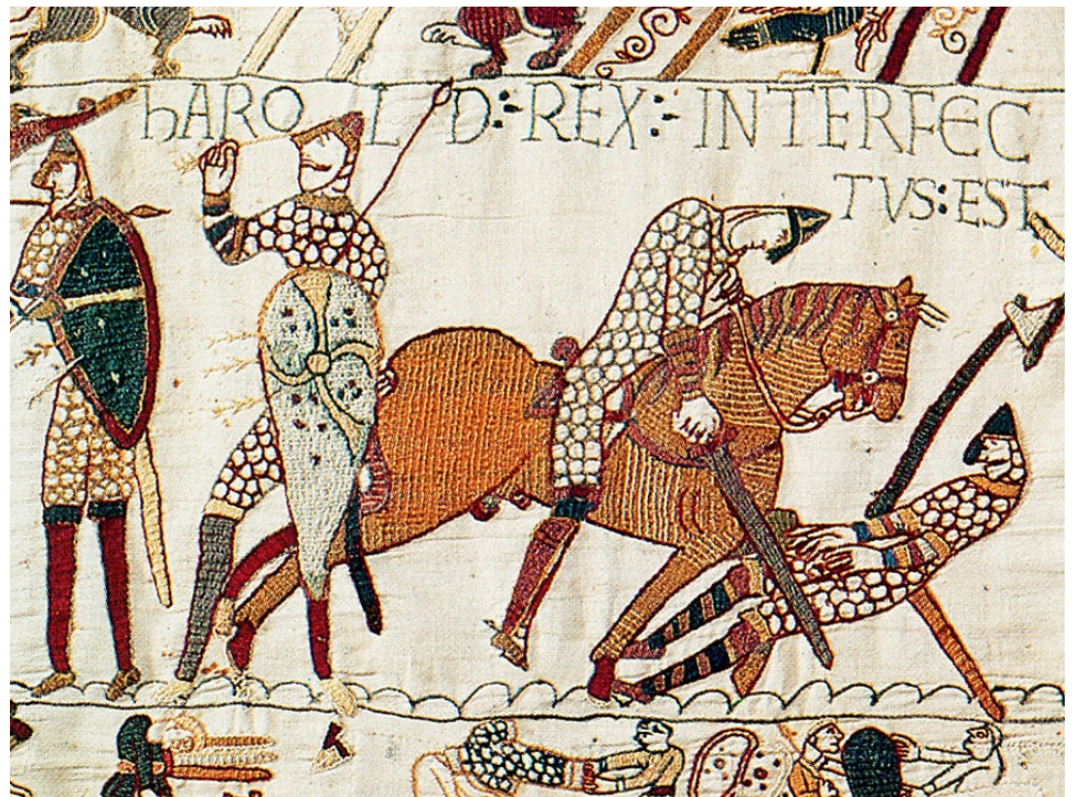
One in the eye: Historians argue about whether the victim (above and left) really is Harold.

Is the world’s most famous embroidery actually British? As France today confirms the loan of the Bayeux Tapestry, an age-old debate has revived over who made the miraculous masterpiece.