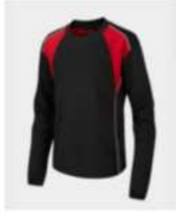
Long Sleeved Jersey Top