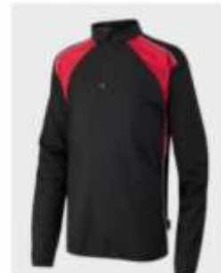
PE 1/4 Zip Top