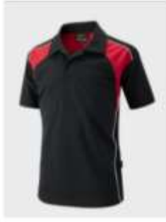
PE Polo Shirt